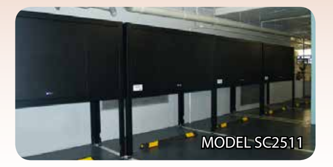
The result was fantastic - a very striking look in the car park, and optimal storage...

For a premium residential apartment complex in Sydney's east we supplied and installed 70 Over Bonnet storage units in the architect's specified colour of powder-coated matt black.