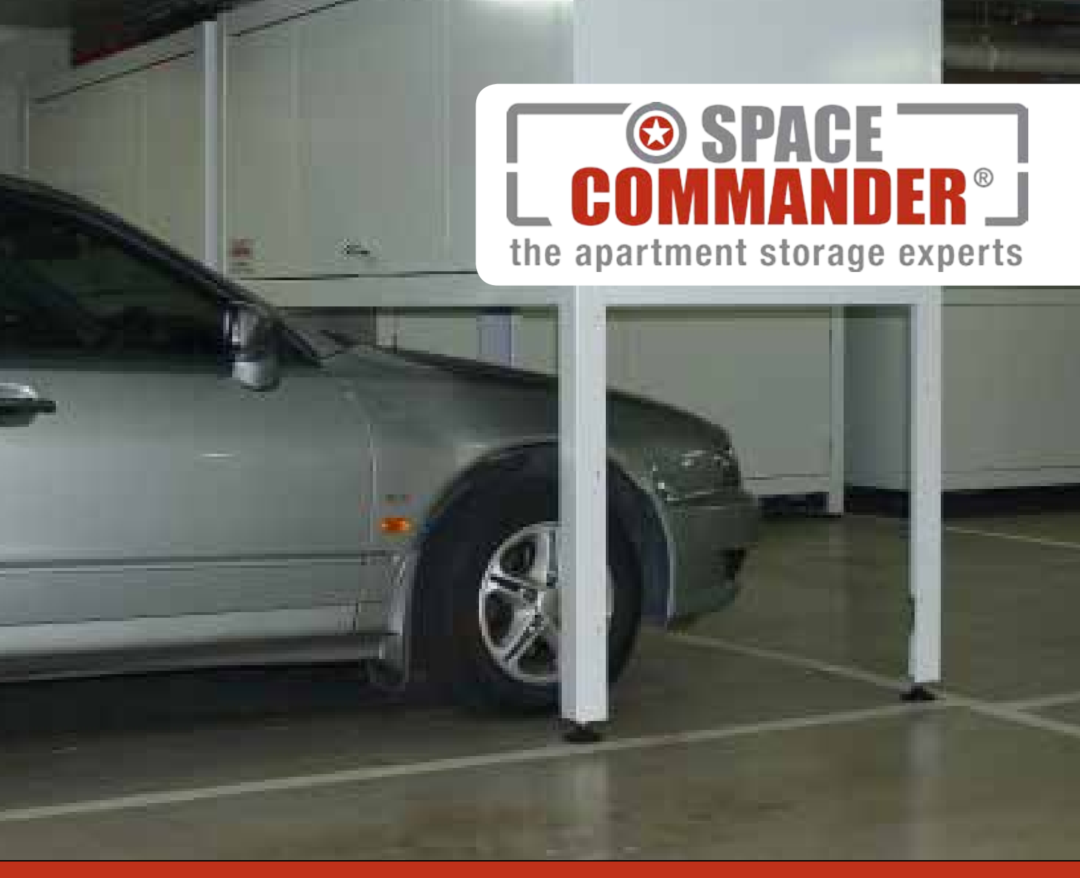
Creating storage space in Australian garages and basements since 2004!